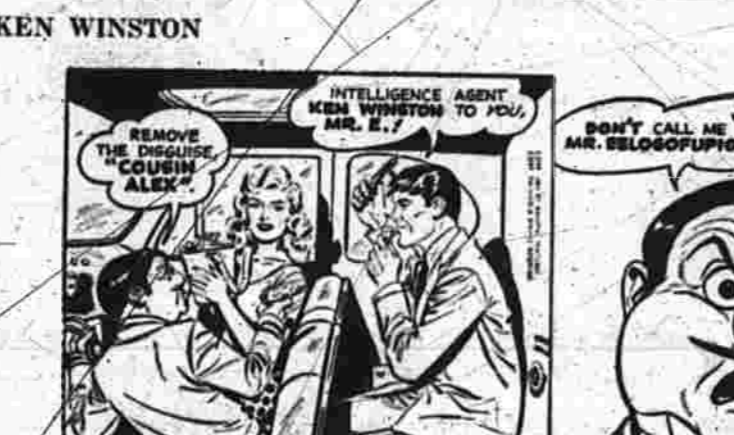
BY MERRILL C. BLOSSER