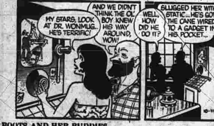
HE'S A WIZZARD BY V. T. HAMLIN