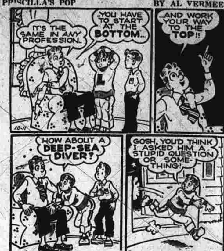
BY AL VERNER