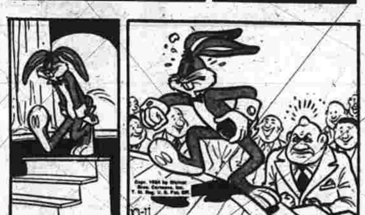
BY JERRY SIEGEL AND OGDEN WHITNEY