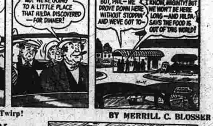
BY MERRILL C. BLOSSER