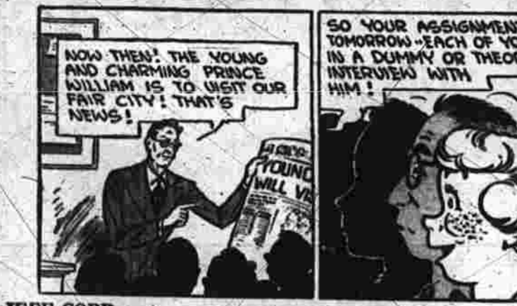
BY PETER HOFFMAN