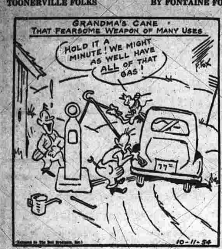
TOONERVILLE FOLKS BY FONTAINE FOX