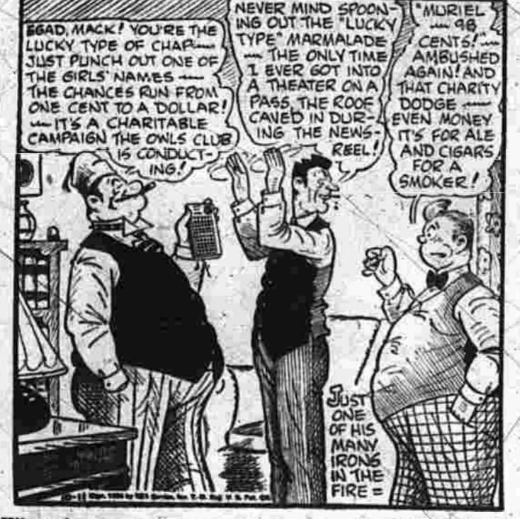
WITH MAJOR HOOPLE