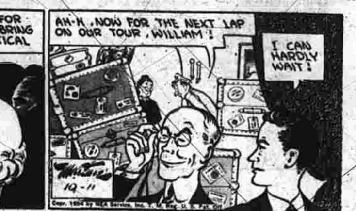
BY LANK LEONARD